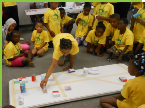
Students work with teachers and volunteers to explore design opportunities and select the best options for their projects.