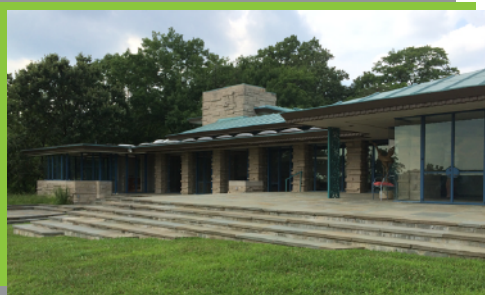
Rear terrace of the Corbett residence.