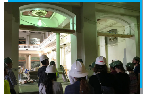
Participants tour Music Hall in June under construction