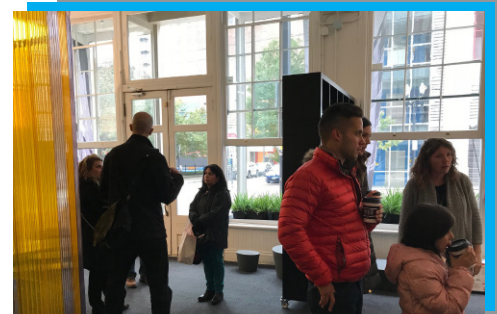
Visiting A359 to learn about their business during Doors Open OTR

The AFC continued to expand its architectural walking tour app that now offers 7 tours of downtown, Over the Rhine and the University of Cincinnati campus. This app is free and available through the App Store and GooglePlay.