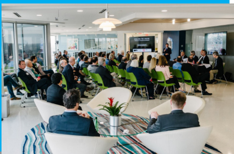
Participants engage in dialogue with the roundtable panelists at Graydon