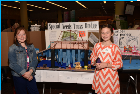
Students display their bridge project at the Design LAB Exhibit at the Library

Design LAB: Learn And Build completed its 21st year in operation and the third consecutive year under the leadership of the AFC. The 2017 program theme was Bridge, and over 2,200 students in more than 100 classrooms participated in the program. More than 80 volunteers presented the students with the challenge to design a bridge of their choice, and the projects ranged from pedestrian bridges to landscape bridges to allow for animal migration to trans-oceanic bridges to allow people to drive between continents! In addition, high school students were given the option to design a bridge out of balsa wood that was tested to collapse at a special event at DAAP, hosted by THP Limited. The structural engineers were able to give the students feedback about their designs and how they could have made them stronger.