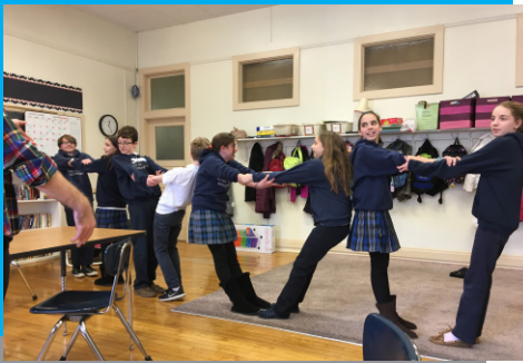
Students learn how structural forces work in bridges using a simple exercise

Design LAB: Learn And Build completed its 21st year in operation and the third consecutive year under the leadership of the AFC. The 2017 program theme was Bridge, and over 2,200 students in more than 100 classrooms participated in the program. More than 80 volunteers presented the students with the challenge to design a bridge of their choice, and the projects ranged from pedestrian bridges to landscape bridges to allow for animal migration to trans-oceanic bridges to allow people to drive between continents! In addition, high school students were given the option to design a bridge out of balsa wood that was tested to collapse at a special event at DAAP, hosted by THP Limited. The structural engineers were able to give the students feedback about their designs and how they could have made them stronger.