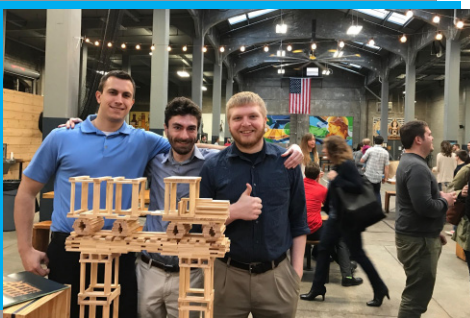
Attendees at the Charitable Suds event at Rhinegeist build their own models

The AFC offered 6 programs and tours in 2017 that addressed a wide range of issues.