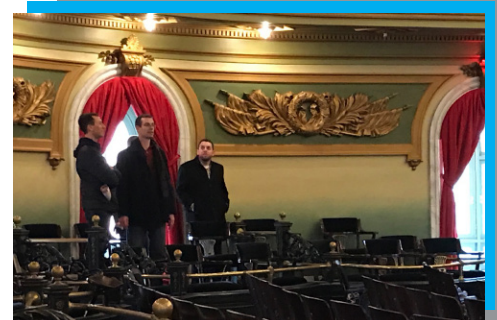
Experiencing Memorial Hall's transformation during Doors Open OTR

This program was offered free of charge to the public thanks to a generous grant from the Carol Ann & Ralph V. Haile, Jr. US Bank Foundation as well as contributions from many of the AFC's Corporate Partners.