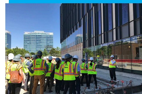
Participants tour the new College of Business

The AFC continued to expand its architectural walking tour app that now offers 8 tours of downtown, Over the Rhine, Covington and the University of Cincinnati campus. This app is free and available through the App Store and GooglePlay.