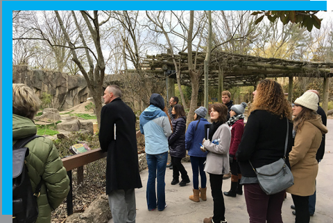
Attendees learn about construction methods at the Gorilla Exhibit