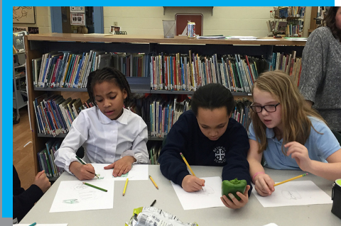
Students learn what an architectural section is by drawing a pepper