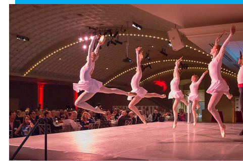
Apple attendees enjoy a performance from members of the ballet