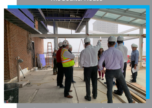
Participants tour the Lytle Park Hotel