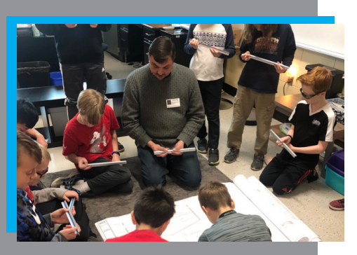
Students learning what an architectura scale is and how they are used