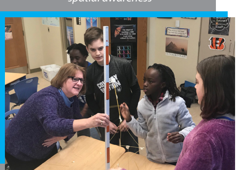
Stuednts measuring their spaghetti