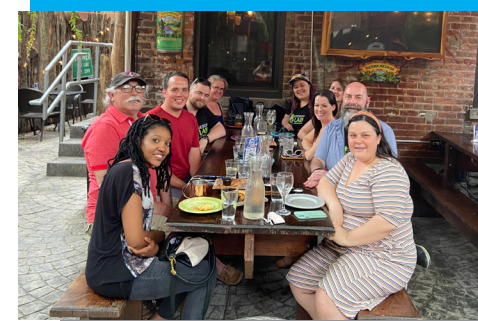
The Design LAB Board celebrating a successful year