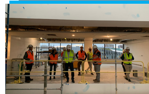
Skanska presenting a construction tour at University of Cincinnati