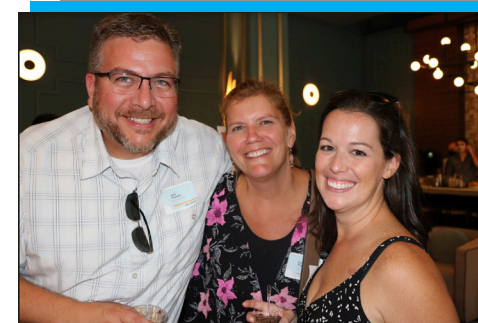
Dine with Design guests enjoying the event with the AFC's Executive Director