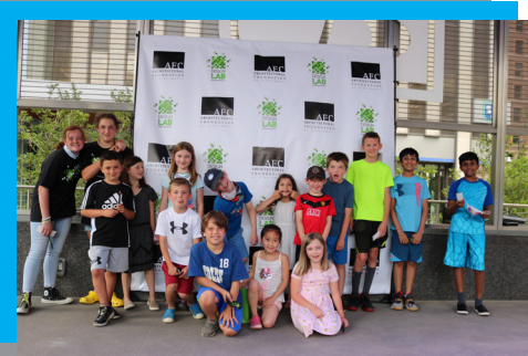
Students at the Awards Ceremony