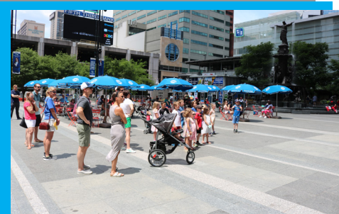
Attendees at the Awards Ceremony