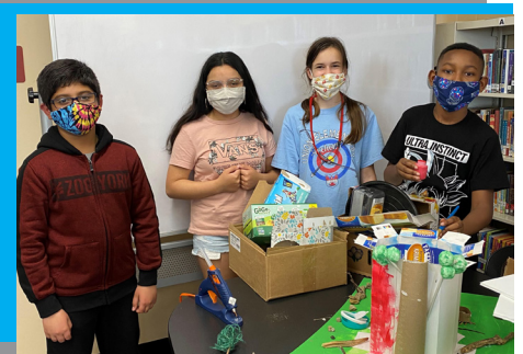
Students presenting their Dwelling