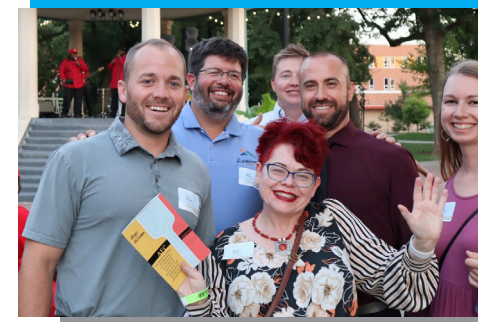
Dine with Design guests enjoying the event