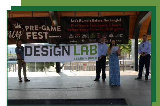
AFC announcing their rebrand to Design LAB: Learn + Build