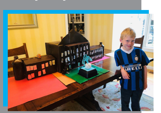
A student modeling with his Dwelling