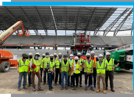
Hard Hat Tour of the new FC Cincinnati stadium