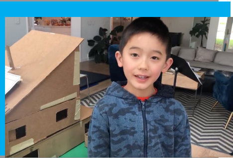
A student posing with his award-win