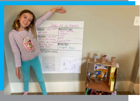
student presenting her at-home built