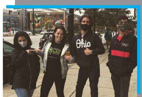
eek Cincy Team out & about findina clues