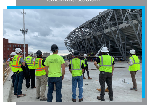
Hard Hat Tour of the new FC Cincinnati stadium